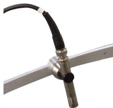
Microphone Mounting for MF710 and MF720